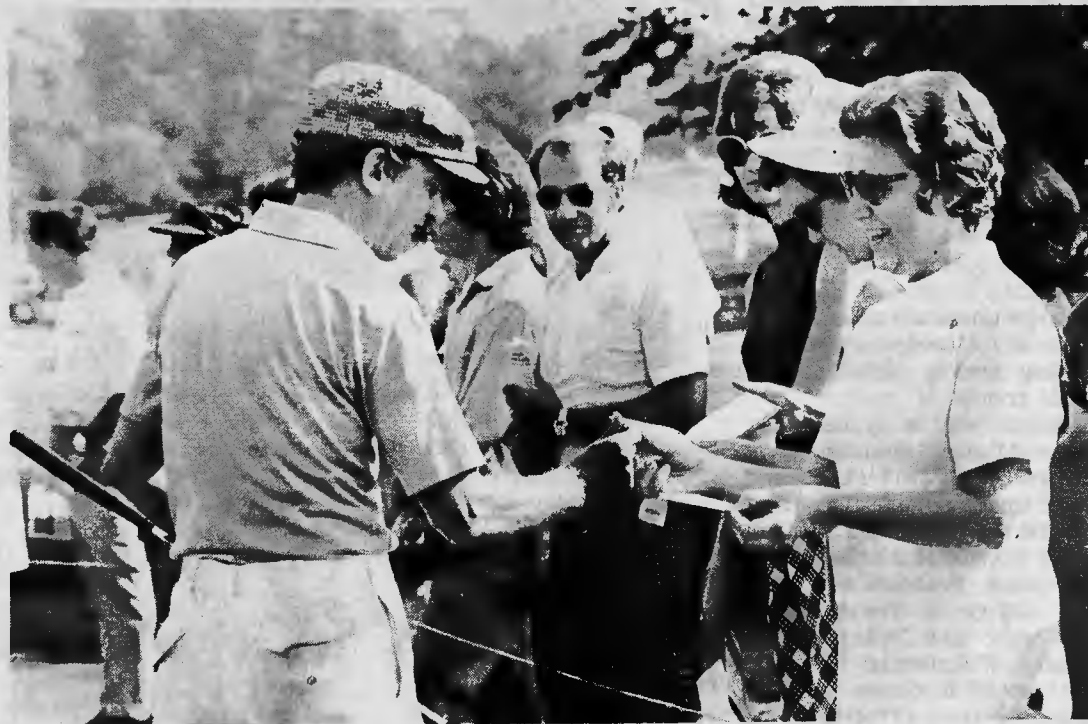
POPULAR AT PRO-AM — Comedian Don Knotts was one of the more popular celebrities at Tuesday's World Golf Hall of Fame Celebrity Pro-Am Tournament which launched the "Grand Week of Golf" at Pinehurst.