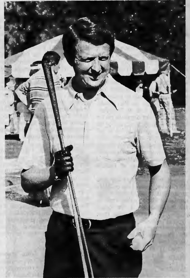
GOVERNOR READY — Governor James Holshouser, who is serving as Honorary Chairman for the "Grand Week of Golf," gets ready to play in the Celebrity Pro-Am Tournament.