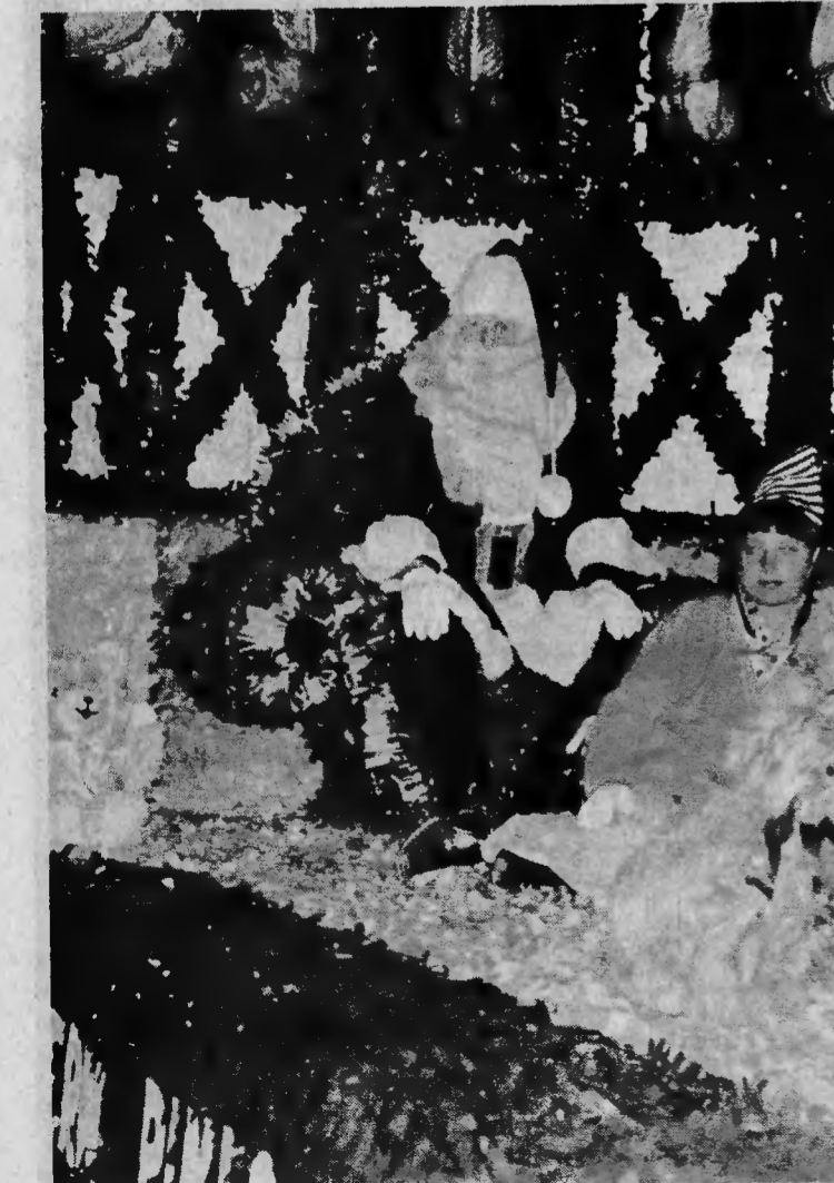
SANTA COMES CALLING — Santa Claus came calling on the Sandhills Thursday night, riding in the Jaycee-sponsored Christmas parade in downtown Southern Pines.

Cub Scouts piled into trucks, Girl Scouts marching and singing, Brownie Scouts carrying flags, high school bands stepping smartly, a drill team performing, fire trucks, classic cars, sparkling floats and gorgeous girls in glamorous garments—they all added up to one of the prettiest, liveliest Christmas parades ever to be seen here last Thursday night.