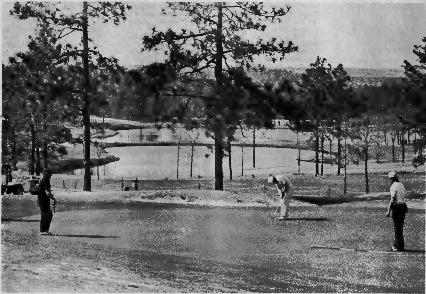
HYLAND HILLS VISTAS — One of the most beautiful views in the Sandhills is that from the Hyland Hills golf course at Southern Pines. Here golfers play on the weekend with the pine-studded rolling hills as a backdrop.