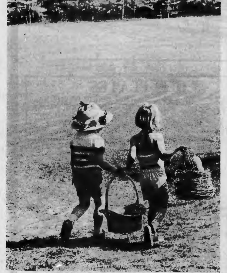
EGG HUNT — The expanse is wide but the hopes are high as these two youngsters start out on an Easter Egg Hunt held Sunday afternoon at the Campbell House under the sponsorship of the Southern Pines Parks and Recreation Dept., and the Kiwanis Club of the Sandhills.