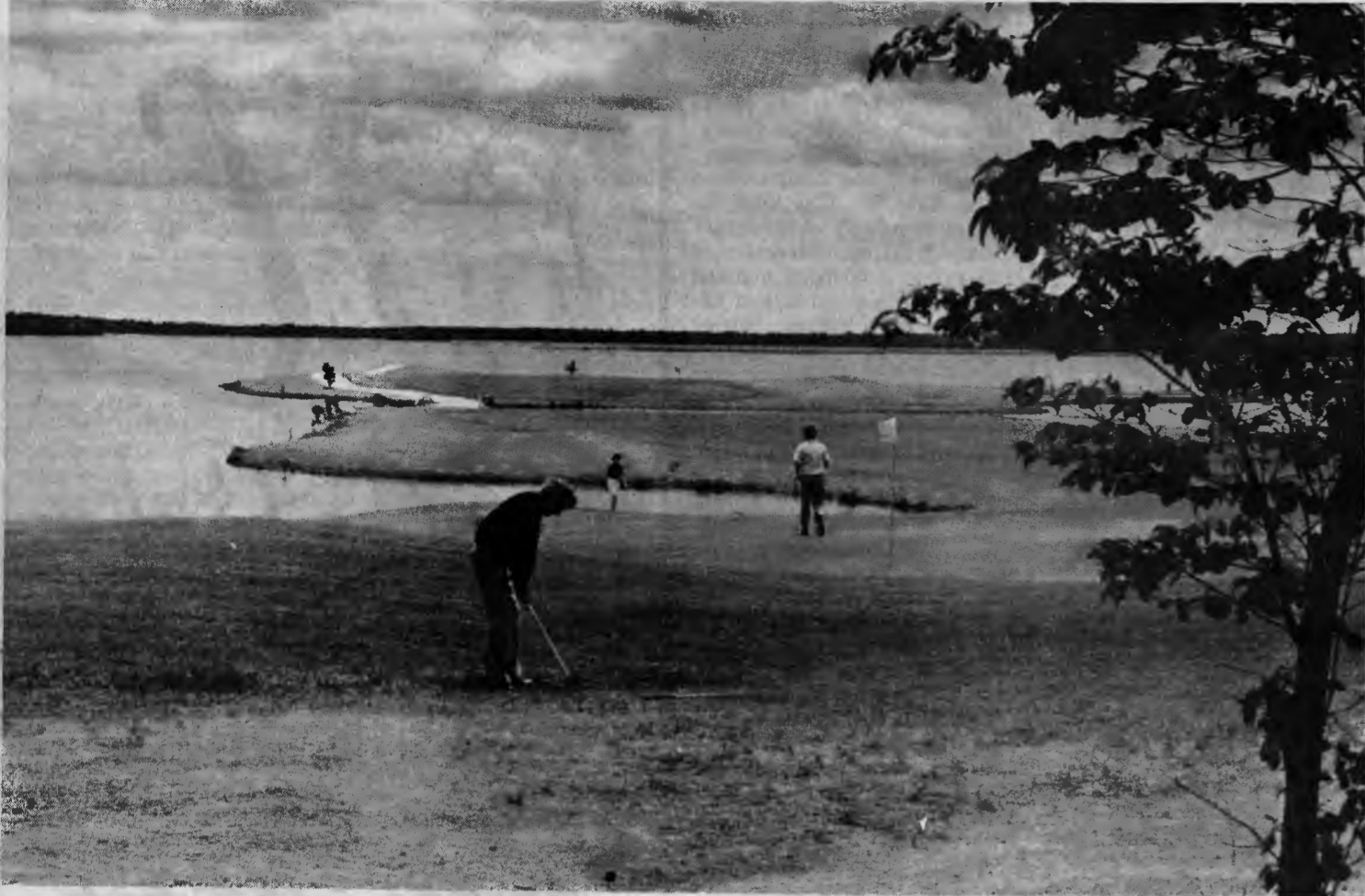
WATER VISTAS — This is not a golf course but huge Lake Surf where many water sports take place while golfers play along the shoreline. The golf course was filled on Sunday afternoon.