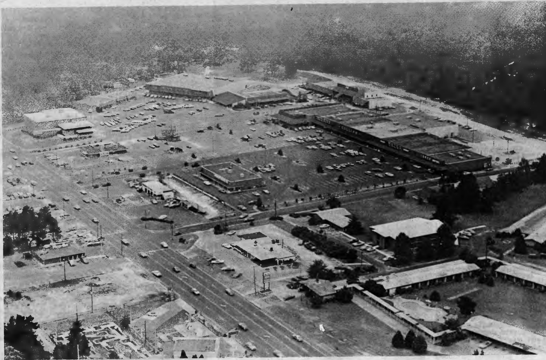
SHOPPING CENTER SOLD — The Town and Country Shopping Center on U.S. 1 South was sold Tuesday by Storey Corp., headed by Voit Gilmore, to Balcor Income Properties, Ltd., of Skokie, Ill., for $2,808,000. The center of 17 acres with 46 business firms was opened in 1964.—(Aerial Photo by Glenn M. Sides from plane piloted by Kurt Cunningham).