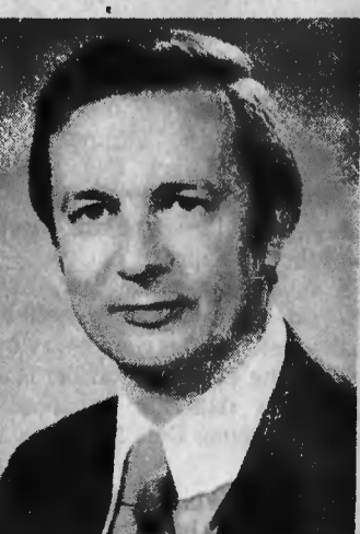
GOVERNOR TO SPEAK — Governor Jim Hunt will speak to the Annual Meeting of the N.C. Forestry Association Friday at 4:30 p.m. at Mid Pines Club in Southern Pines.