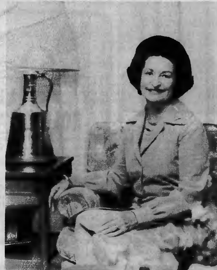
COMING HERE — Invitations were sent this week for a luncheon at which the nation's former first lady, Mrs. Lyndon B. Johnson, will speak at the Pinehurst Country Club on Friday, Jan. 12. The luncheon is being held for the benefit of Friends of Weymouth.