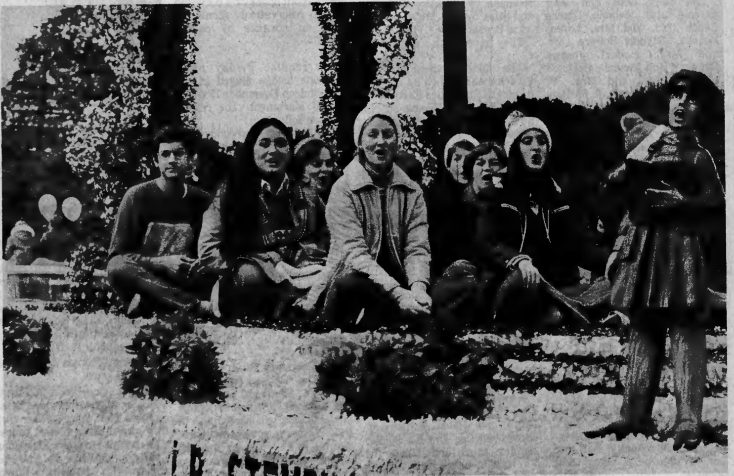
CHRISTMAS PARADE —These young people on the J.P. Stevens Co. float sang as they rode in the Jaycee-sponsored Christmas Parade in Southern Pines Saturday morning. A large crowd gathered for the downtown parade which included Santa Claus.