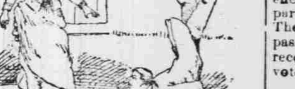
She had almost despaired of his coming.

She had almost despaired of his coming. The hours since they had separated grew into days, the days into weeks, and the weeks into months.