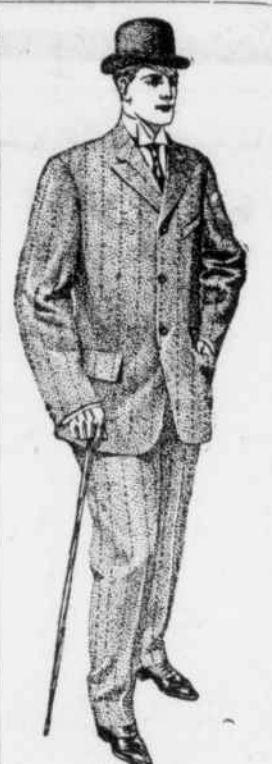
Smallenburg Clothes ESTABLISHED 1896, THE EXCELLENCE CLOTHING CO.

The remainder of our Winter Clothing must be sold within the next 60 days. It will pay you to drive 25 miles to buy your Clothing at our store. We guarantee to save you from 25 to 50 per cent. on every suit bought of us. We have the largest and best selected stock of Clothing ever shown in Johnston County.