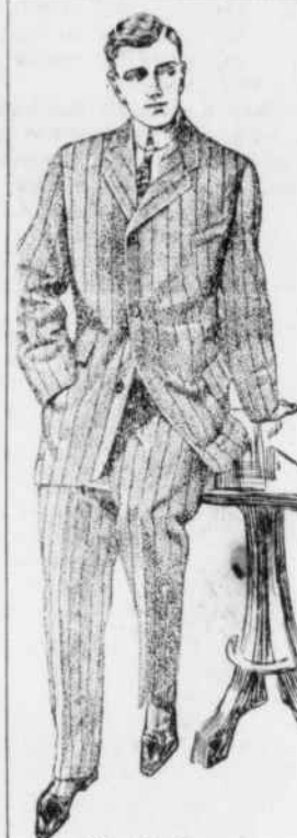
Smallenburg Clothes ESTABLISHED 1896, THE EXCELLENCE CLOTHING CO.