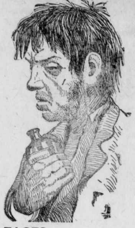
A STUDY IN FACES

What a bright, earnest face this boy has! Just such a face as everybody likes to see. Many years ago a great artist wanted to make an attractive picture for his studio, and he chose such a face. He called it "Innocence," and you might label this boy with the same word.