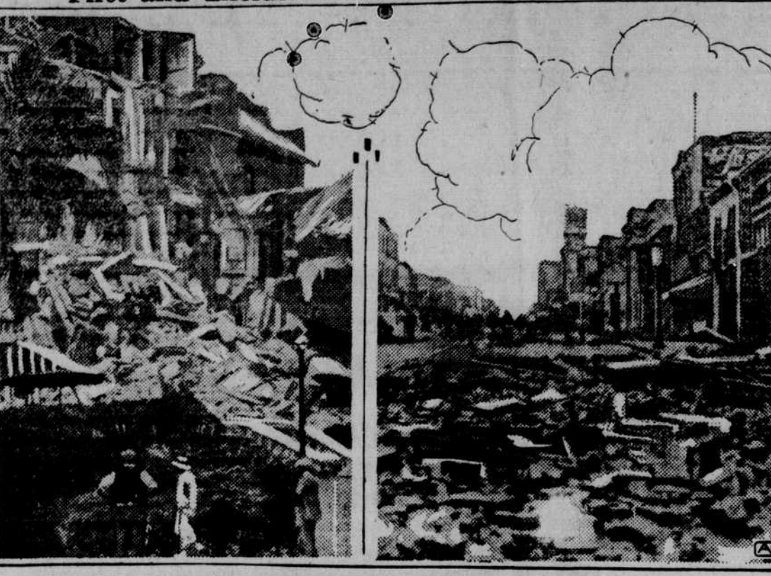
Here are two remarkable pictures, sent by telegraph, of the ruin in Santa Barbara, Calif., caused he earthquake. At the left, the photo shows the ruins of the famous Arlington Hotel, almost comletely wrecked. At the right-a view of State Street-principal business thoroughfare-as it looked one hour after the quake