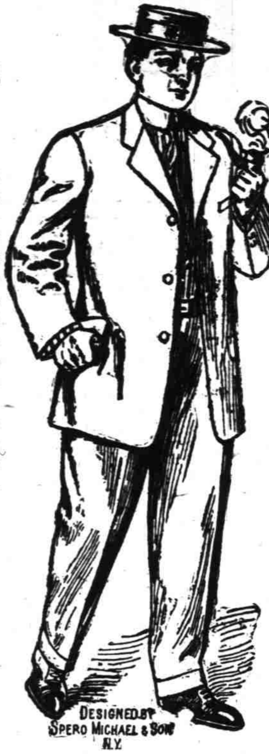
DESIGNED BY SPERO MICHAEL & SON N.Y.