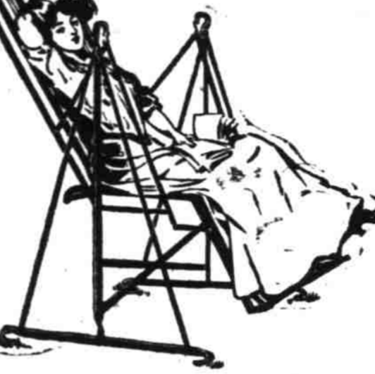
COOL BY DAY