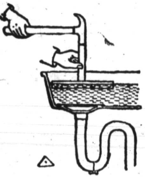
CLEANING THE DRAINPIPE.

has an obstruction in the outlet pipe which cannot be removed with a bent wire, the usual resource aside from a suction pump, which is rarely availa