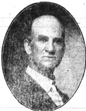
From a Late Snapshot

Consultations and Examinations Confidential, Invited and FREE