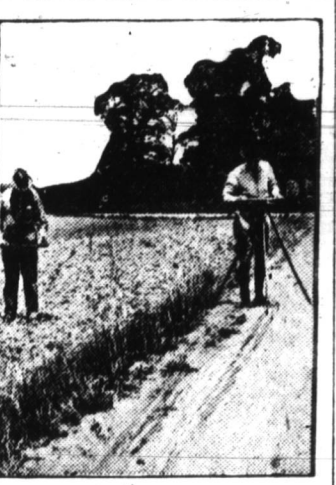
Soil Survey Party at Work.

Soil surveys made by the bureau of soils, United States Department of Agriculture, are filling an increasing variety of demands. Prominent among these demands, in addition to those coming from the co-operating states, are those from development companies interested in opening up large tracts of cut-over land to settlement, from