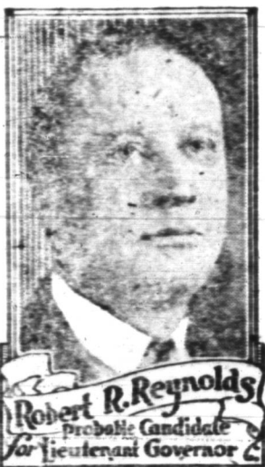
Robert R. Reynolds Probable Candidate for Lieutenant Governor

ASHEVILLE, May 21.—That Robert R. Reynolds, familiarly known as Bob Reynolds, veteran campaigner and political figure in North Carolina politics for the past 15 years, will be