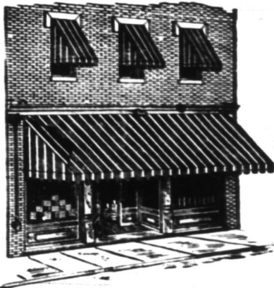
For Awnings, Awning Covers and Tents of all kinds. See Harrison Bros. and Co.

These who are in a "run-down" condition will notice that Catarrh bothers them much more than when they are in good health. This fact proves that while Catarrh is a local disease it is greatly influenced by constitutional conditions. HALL'S CATARRH MEDICINE is a Combined Treatment, both local and internal, and has been successful in the treatment of Catarrh for over forty years. Sold by all druggists. P. J. Cheney & Co., Toledo, Ohio.