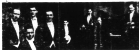
THE PLYMOUTH MALE QUARTETTE