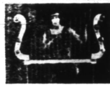
CLARKE NOVELTY COMPANY