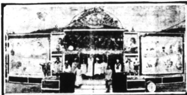
At Roanoke Fair Here Next Week