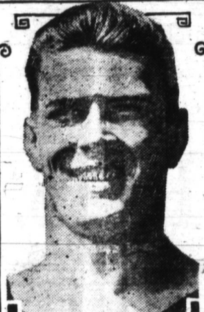
Down He Goes