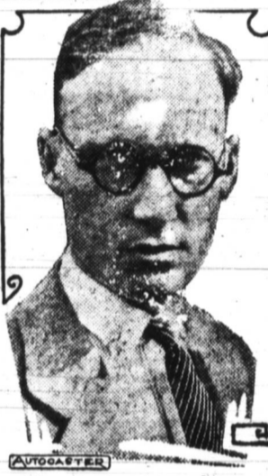
John T. Scopes, professor of biology at Dayton, Tenn. high school, on trial there for violating the "monkey-law"—or, charged with teaching the theory of evolution. It is a test case watched with a great deal of interest throughout the country.