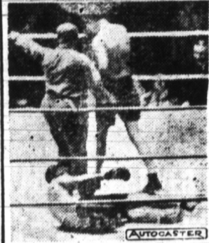
Lower picture shows the veteran Tom Gibbons of St. Paul, down for the count when knocked out in the 12th round by Gene Tunney at N. Y. last week. Tunney (above) says he is now ready for Dempsey.