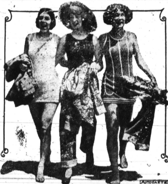
"No more sun-burned knees" is given as the reason for the newest style—which brings forth the beach pajamas. The fair bather in the center is wearing them—or to be exact—half of them—the lower half.