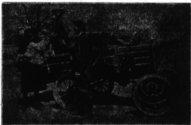
Above is shown the Phunny Phord Phree act, one of the side-splitting free acts to be put on at the Roanoke Fair this year. This attraction was well recommended to the fair management and should prove one of the biggest attractions there.