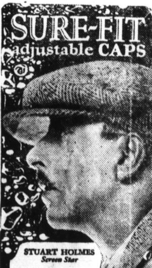
STUART HOLMES Screen Star

Would You Buy A Silver Spoon Without The Sterling Mark?