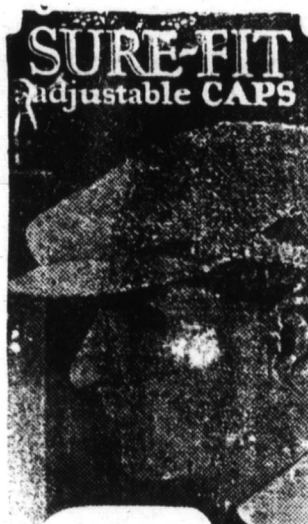
MILTON SILLS Screen Star

A complete range of patterns to choose from will be found in our store.