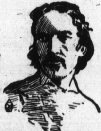
ROBERT LOUIS STEVENSON