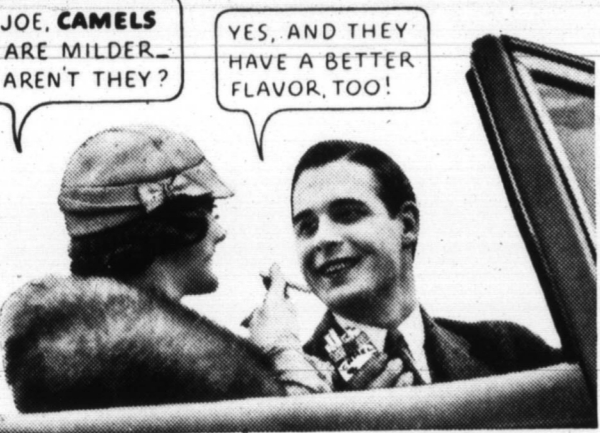
Camel's costlier tobaccos taste better

Fares proportional from and to many other points. Similar Excursions Aug. 4, 5; Sept. 1, 2, 3; Oct. 6, 7; Nov. 28, 29. Reduced Pullman charges. Further details from Ticket Agents of ATLANTIC COAST LINE "The Standard Railroad of the South"