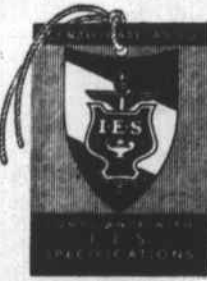
The tag above is your guarantee that this lamp has passed all of the rigid tests and inspections to meet the specifications furnished by the Illuminating Engineering Society.

This scientifically designed lamp meets your decorative requirements as well as your sight requirements. Complete with "Three-lite" Mazda Lamp.