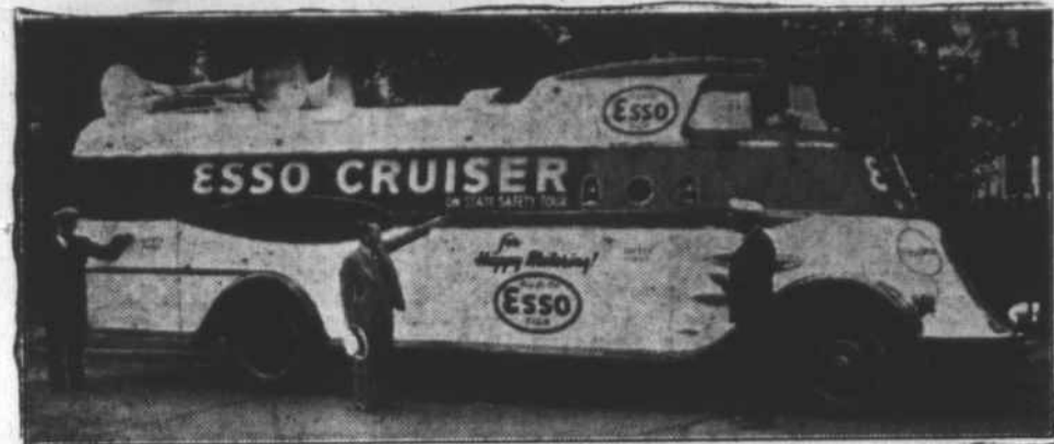
The large and unique cruiser of the Standard Oil Company, pictured above, will reach here tomorrow afternoon and feature a safety program at 8 o'clock that evening on the Main Street lot next to the Guaranty Bank and Trust Company. The program, free to all, follows a parade of the streets here.