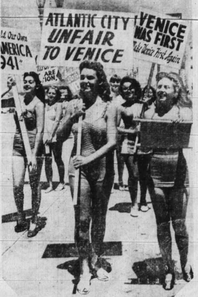
Beauties of Venice, Cal., resent the monopoly Atlantic City, N. J., apparently has on the beauty business and stage a demonstration to show how they feel. Venice says America's first bathing beauty contest was staged there in 1912. This year Venice plans to stage its own contest to select Miss America of National Defense. There have been no communiques from Atlantic City.