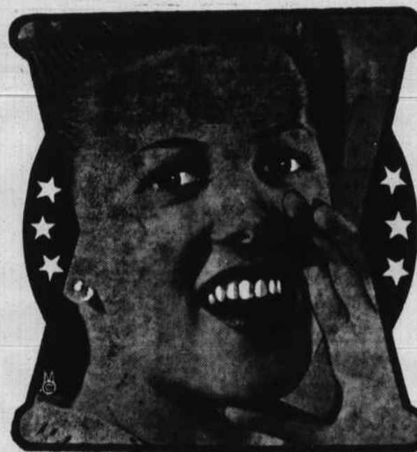
MISS TEXACO They All Call For Texaco

Call Us for the Best Nos. 1 and 2 Fuel Oil for Homes, Farm Use and All Purposes