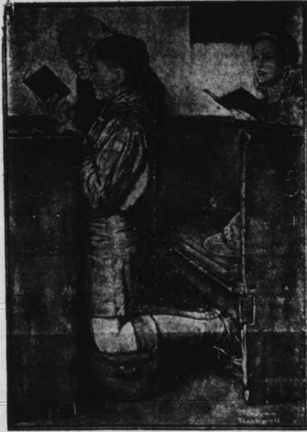
MAINTAINING that no boy can become the best kind of citizen without recognizing his obligation to God, the Boy Scouts of America, in this new Norman Rockwell painting, symbolizes the spirit and meaning of its Twelfth Scout Law: "A Scout is reverent. He is reverent toward God. He is faithful in his religious duties and respects the convictions of others in matters of custom and religion."

about to happen, to all of us in varying degrees.