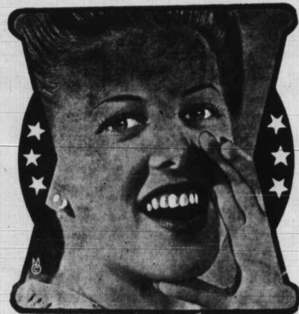
MISS TEXACO They All Call For Texaco

Call Us for the Best Nos. 1 and 2 Fuel Oil for Homes, Farm Use and All Purposes