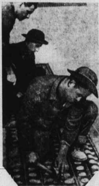
Army engineers are shown at work on the portable airport being laid down at Marston Strip, S. C. Metal strips 16 inches wide and 10 feet long are locked together to form a runway 150 feet wide and 3,000 feet long. The job takes two weeks. Holes in the metal mat permit grass to grow through it and serve as camouflage.