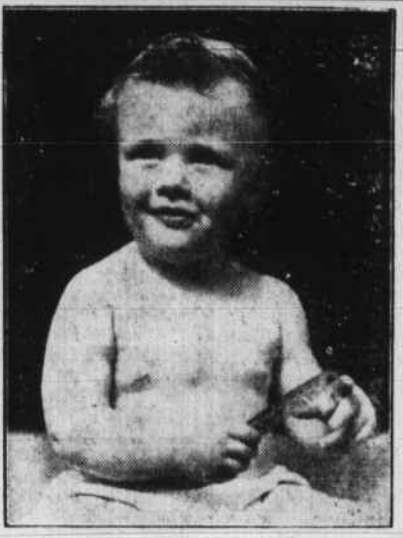
"I'm Facing the Future With Security . . ."

Pour yourself a teaspoonful of Buckley's CANADIOL Mixture—let it lie on your tongue a moment then swallow slowly. Feel its quick, powerful, effective action spread through throat, head and bronchial tubes. Acts like a flash. Right away it starts to loosen thick, choking phlegm and open up clogged bronchial tubes. Over 10 million bottles sold in cold wintry Canada. A single sip will tell you why. Spend 45 cents today at Clark's Pharmacy or any drug store for a bottle of Buckley's CANADIOL Mixture.