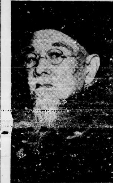
ABOVE is the latest picture received in this country of Lin Sen, president of China. President Lin lives on the outskirts of much-bombed Chungking.