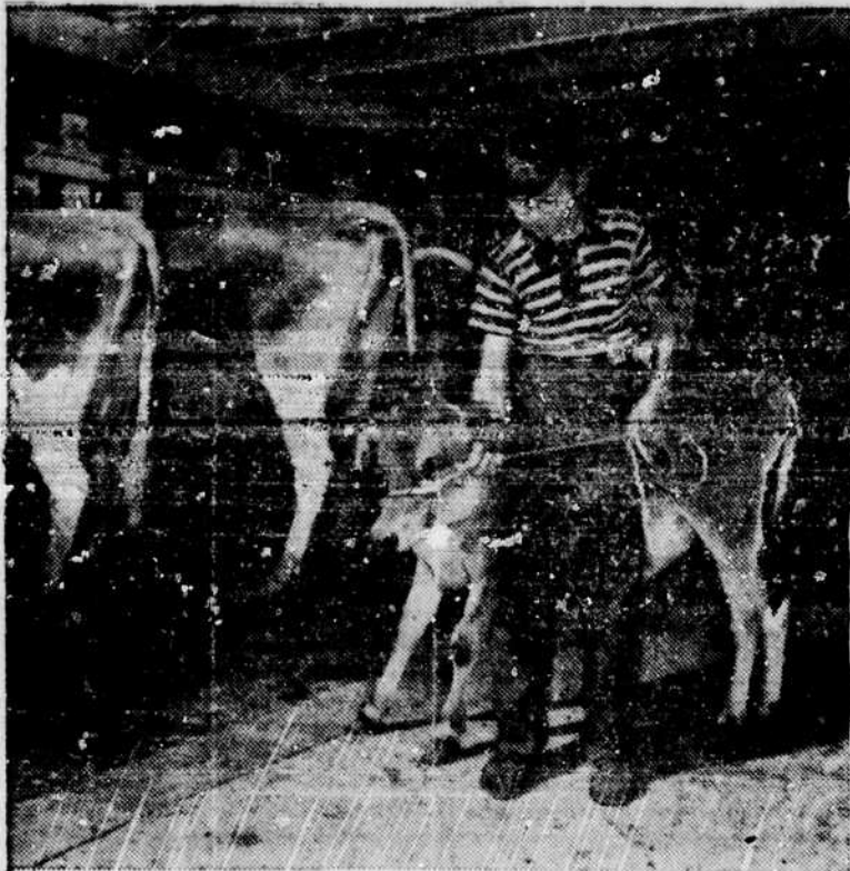
Farm boys and girls can help beat the Axis in many ways. This chap is raising calves—excellent insurance against a shortage of milk, butter, cream, cheese, and meat for the healthy American family.