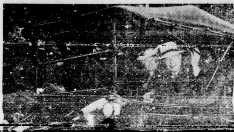
LIKE THE COBBLER whose children went barefoot, John D. Rockefeller, head of the Standard Oil house but rationed on gas like the rest of us, arrives with Mrs. Rockefeller at dedication ceremonies at Philippe Castle, near Tarrytown, N. Y., driving his 35-year-old electric. He donated the car's to history as a museum.