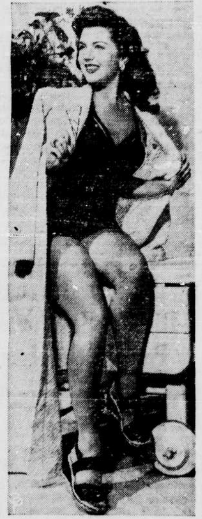
PRETTY Ann Rutherford, Hollywood film star, has issued undated invitations for a swimming party at her pool in which an effigy of Hitler will be tossed into the water and "drowned" on the day that the Nazi regime ends.