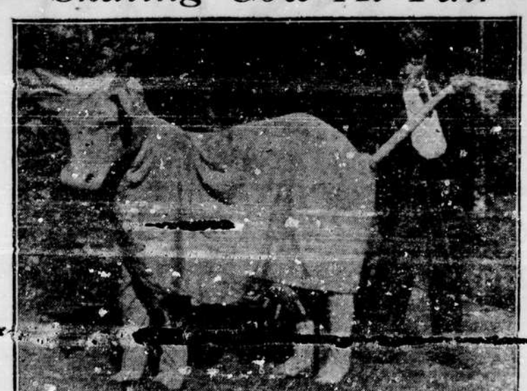
Included in the list of entertaining acts booked by the American Legion for the fair