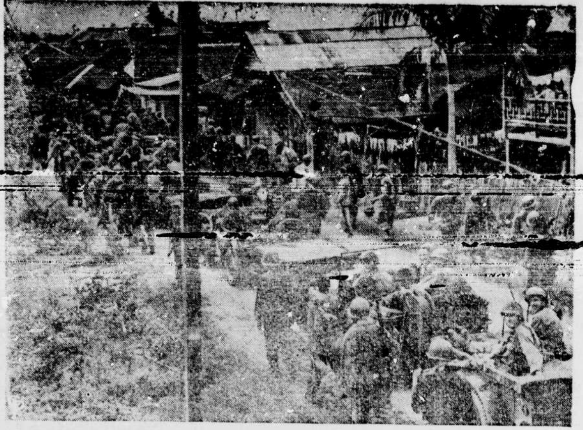
LONG LINES OF U 5. IROOPS and vehicles are shown here moving past picturesque native houses in Tacloban, on Leyte Island. Here the fighting has grown tougher and bloodier as the American land forces move closer to Ormoc where the Japs managed to land fresh troops