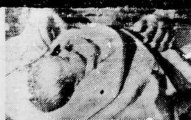
This little Greek girl, in a ragged sweater mothers her baby sister, who is wrapped in the only blanket the family owns. Millions of innocent war victims overseas have no decent clothes to put on and no warm bedding. Help them by contributing your spare garments, shoes and bedding to the United National Clothing Collection.