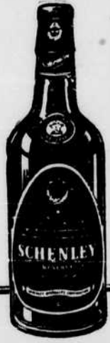
Blended Whiskey 86 Proof. Sixty per cent Grain Neutral Spirits. Schenley Distillers Corp., New York City

Choice ingredients plus distilling skill create this smoother Schenley blended whiskey bottled at the "Peak of Flavor".