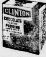
Please Ask Your Local Grocer.