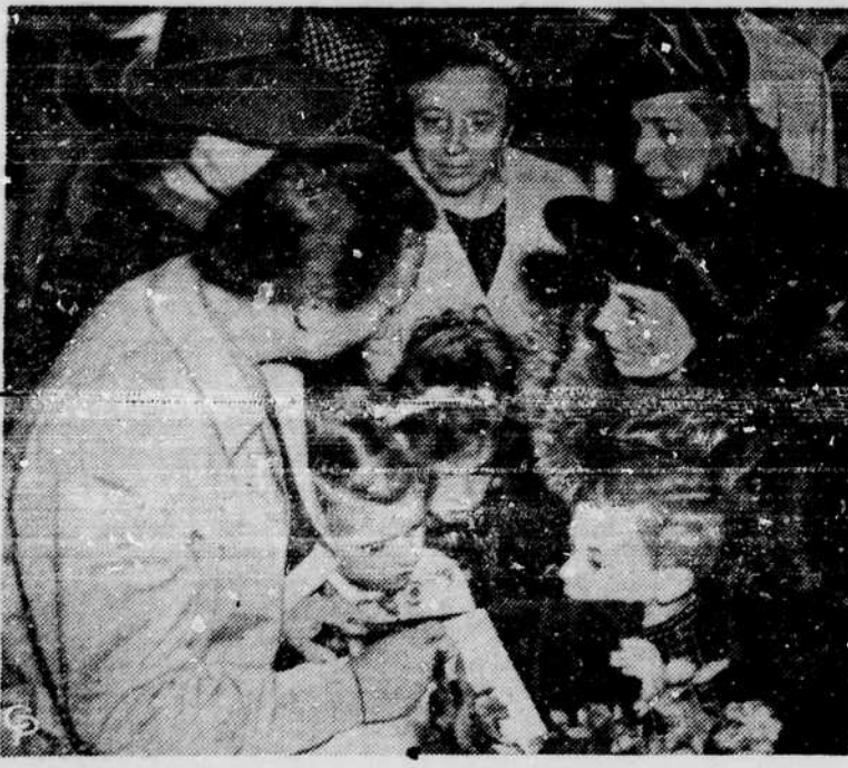
GERMAN MOTHERS register their little ones for classroom study in Aachen under the Allied Military Government order reopening ten local schools to small students in the first to the fourth grades. With carefully screened teachers and a thoroughly disinfected curriculum, the re-education of Germany thus began close to the cradle.