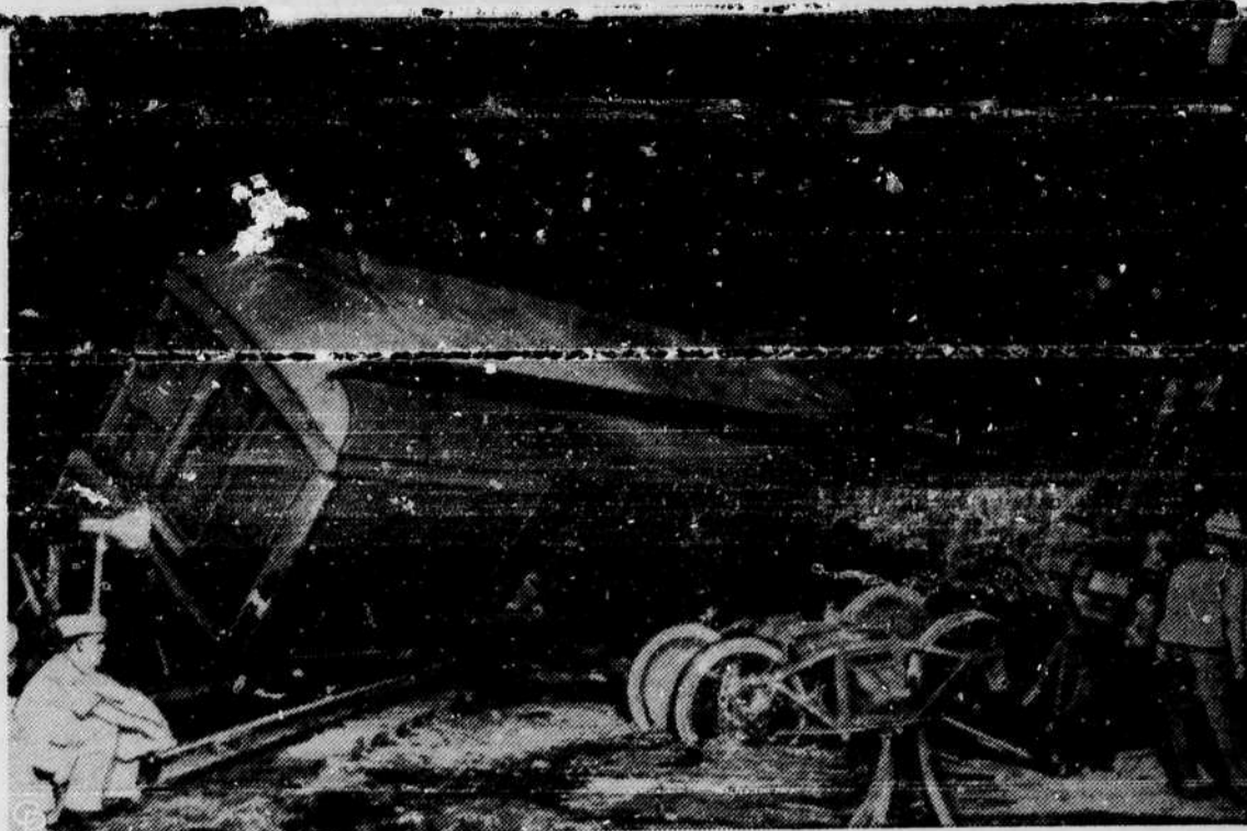
SHOWN ABOVE IS ONE OF THE SEVEN CARS that were derailed when a Boston-to-New Bedford, Mass., train jumped a switch near Taunton, Mass. The engineer and fireman were killed and 54 passengers were injured in the derailment. Rail traffic in the area was tied up for several hours.