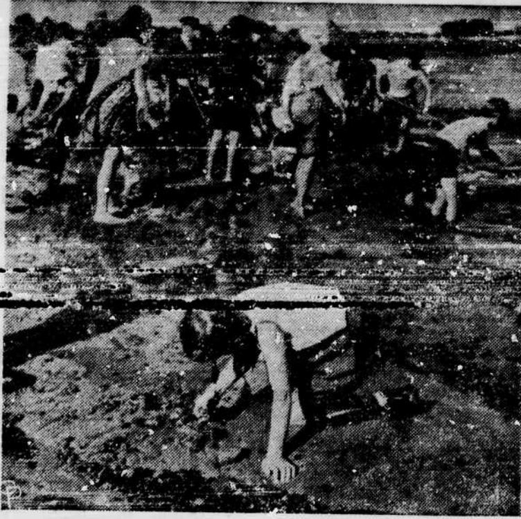
MATCHING THEIR COUNTRYMEN who've gone into the forests for twigs, these Germans gather bits of coal—and hope to be warm this winter. Wasted or spilled from barges at the Hamburg docks, the crumbs were deposited by dredges on a flat bank of the Elbe.