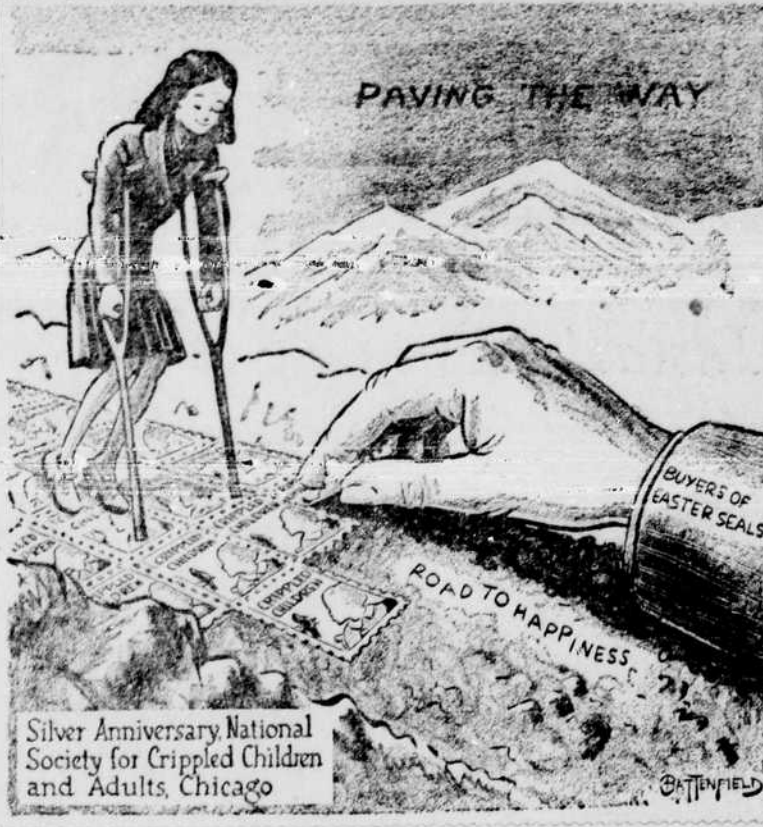
Silver Anniversary National Society for Crippled Children and Adults, Chicago

Peace is the happy, natural state of man; war, his corruption, his disgrace.—James Thomson.