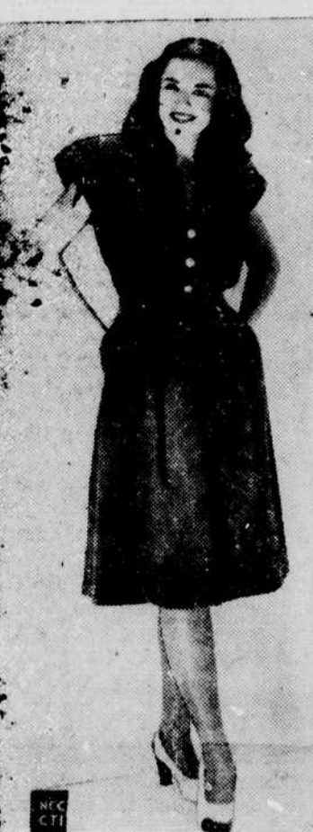
For summer play wear this pretty miss chooses a bare-back, jacket sun dress made from three and a half 100-pound sacks dyed golden brown. The feed sacks are jauntily transformed into a garment which will be an eye-catcher on the beach or the tennis courts.