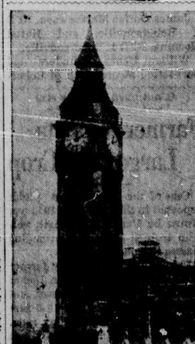
BIG BEN . . . In London, England, the most famous clock in the world annually welcomes the New Year with the booming of its great bell.