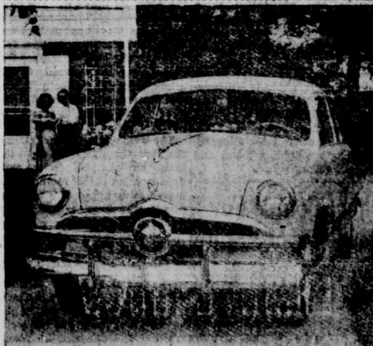
The 1950 Ford Deluxe Tudor Sedan combines the modern styling so widely acclaimed by the car-buying public with the compact and economy demanded of a family automobile. Smart new treatment of the grille and parking lights and a colorful new color—the first in Ford history—distinguish the front of the new model. Comfort seats include new non-sag front seat springs covered with a new foam rubber cushion, additional head room and smoother, quieter V8 and 6-cylinder engines.