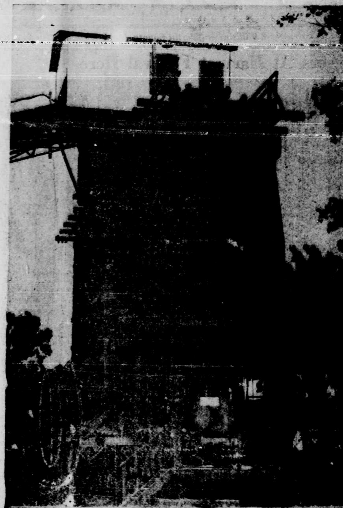
The rock and gravel used in the concrete for the Buggs Island Dam located on the Roanoke River near South Hill, Virginia, is pre-cooled in the cooling tanks shown in the above photograph. This process helps keep the concrete cool after being poured, otherwise heat of hydration resulting from the setting of large masses of concrete tends to make the mass of concrete expand during setting with a severe shrinkage upon cooling. The result is that the concrete will crack. Cooling slows up the generation of heat so that expansion and contraction is more gradual and results in the elimination of cracking.