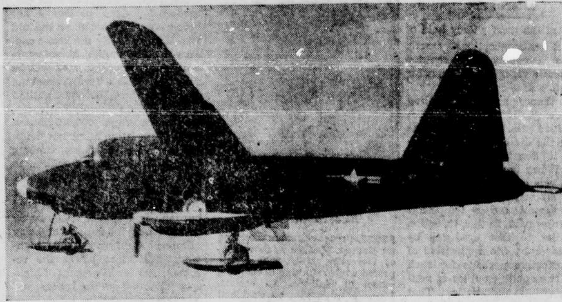
WITH SIXTEEN-FOOT ALUMINUM SKIIS EXTENDED for a landing, the Navy's specially-equipped Neptune tries out its new landing gear at Burbank, Calif. Designed for long-range search and rescue operations over desolate Arctic wastelands, the Neptune can operate from conventional runways, snowfields or from the deck of an aircraft carrier. The plane is the largest combat-type craft ever equipped with skis.