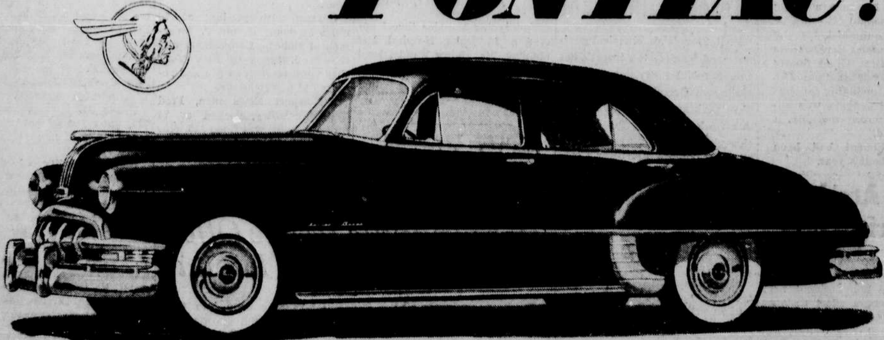
Chieftrain De Luxe 4-Door, Six-Cylinder Sedan (including white sidewall tires and bumper wing guards*)

All that's Good and Desirable in a Fine Car!