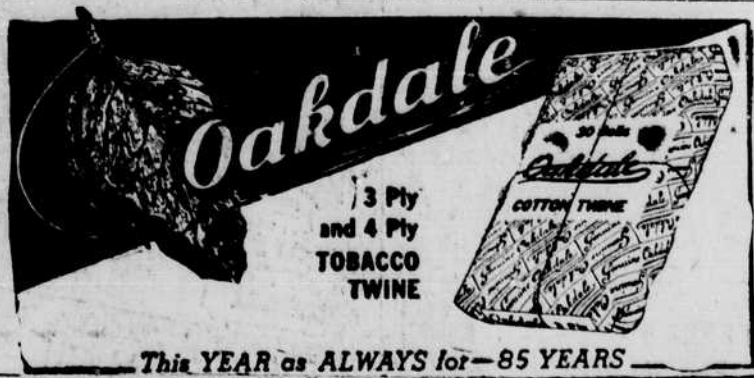
This YEAR as ALWAYS for 85 YEARS

Inhabitant: "Neither can I—that's why I like it!"