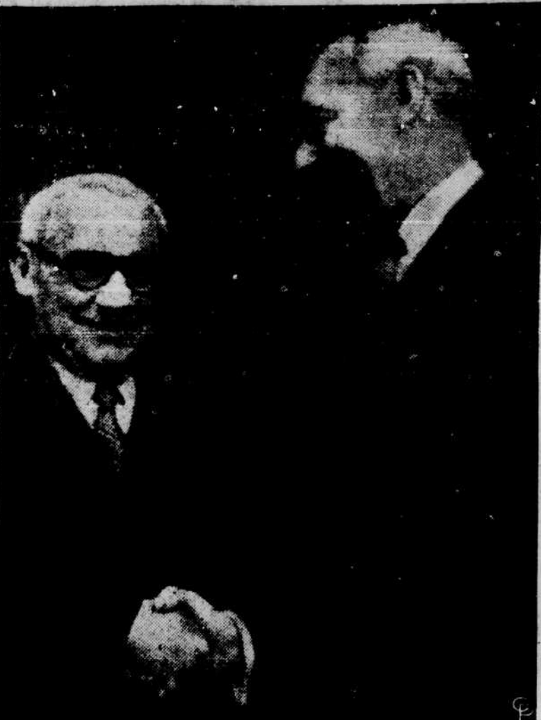
ARRIVING IN ENGLAND for Big Three talks on cold-war strategy, U. S. Secretary of State Dean Acheson is welcomed in London by British Foreign Secretary Ernest Bevin (left). They immediately went into a conference, but neither would comment on this. They will be joined by French Foreign Minister Robert Schuman.